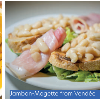
Jambon-Moquette from Vendée