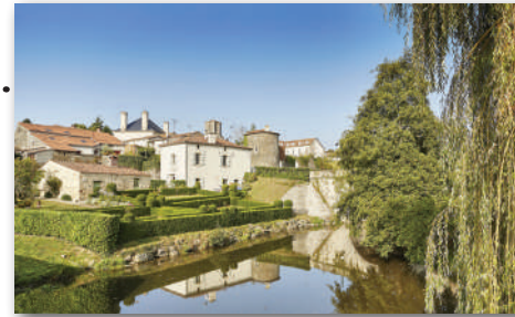
Admire our 9 Petites Cités de Caractère (Little Towns of Character): Apremont, Mallièvre, Foussais-Payré, Niell sur l'Autise, Mouchamps, Vouvant, Pouzauges, Mortagne sur Sèvre et Noirmoutier en l'Île.