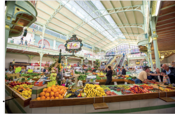
Discover the Vendean lifestyle strolling around our traditional markets.