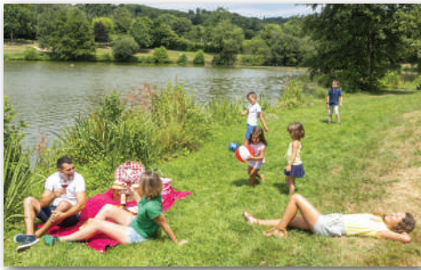
Picnic in Lac de l'Espérance in Pouzauges (ask for the full list of picnic areas in your nearest Tourist Information Office).