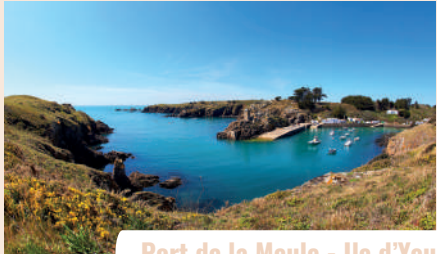
Port de la Meule - Ile d'Yeu

An enchanting getaway on one of the islands