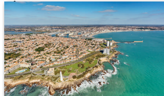
Discover the bay of Les Sables d'Olonne, integrated into the club of the most beautiful bays in the World in 2021.