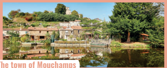
The town of Mouchamps

Travel back in time exploring some of the quaint little villages