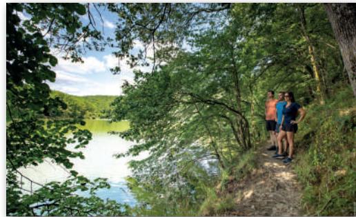
Stroll along the trails in the Mervent-Vouvant forest, the biggest woodland of Vendée.