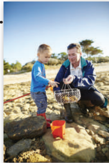
Collect clams on the beach at Saint Jean de Monts.