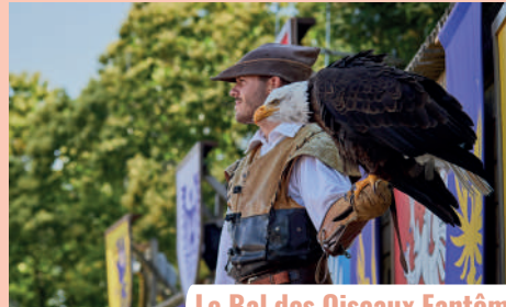
Le Bal des Oiseaux Fantômes