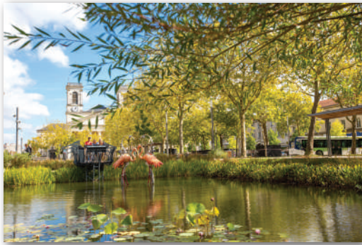
Play with the animals on Place Napoléon in La Roche sur Yon.