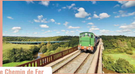
Le Chemin de Fer

Experience #6 Daydreaming on board a legendary train