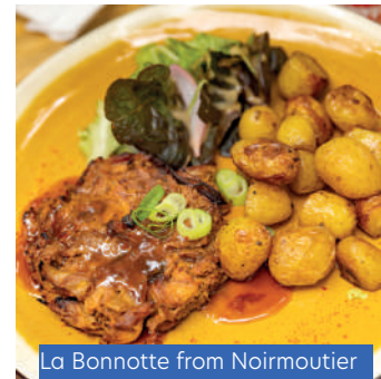
La Bonnotte from Noirmoutier