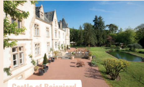
Castle of Boisniard