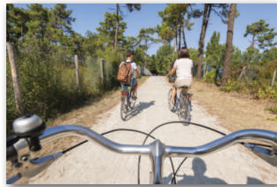
Ride along La Vélodyssée, a cycle route that follows the Vendée's coastline.