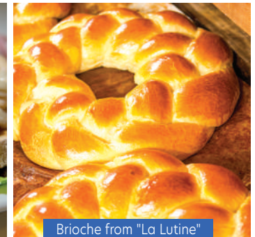
Brioche from "La Lutine"