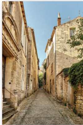
Roam the streets of Fontenay le Comte, a Town of Art and History, a jewel of the Renaissance.