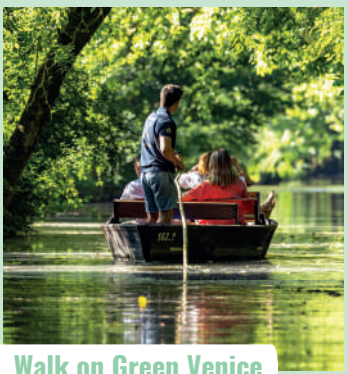
Walk on Green Venice

An unusual excursion to the heart of the Marais Poitevin