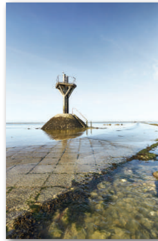
Take the mythical Passage du Gois, the causeway linking the mainland to the Island of Noirmoutier at low tide.